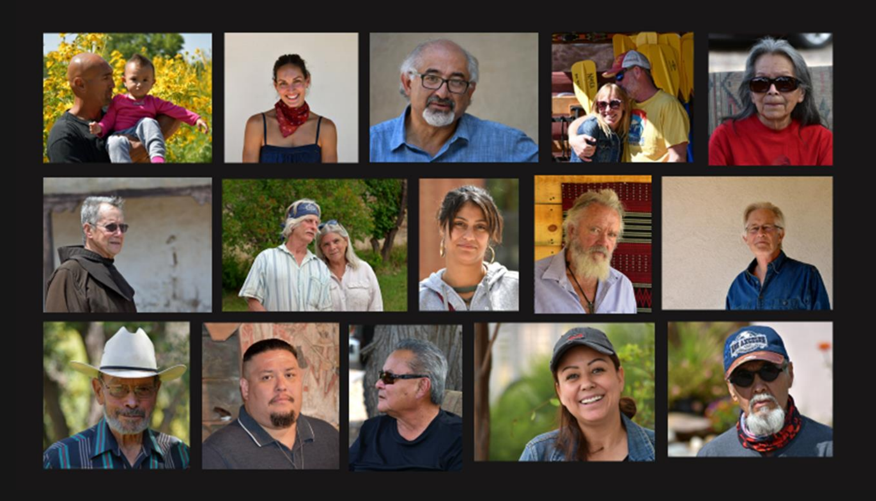
A WORLD OF DIFFERENCE